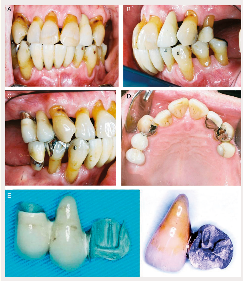
Fig. 2. Severe periodontitis treated for 30 years. Patient now 85 years old. Mandibular FDP 23 years old. FDP <sup>22</sup> 23 18 years old. FDP 15 <sup>14</sup> 13 4 years old. Existing post and core with cervical gold collar of 15 retained and used for retention of the three-unit FDP. FDP in cobalt chromium and porcelain. Resin bonded. A: Frontal aspect. B: Lateral aspect, patient's left.. C: Lateral aspect, patient's right D: Palatal aspect. E: Three-unit and two-unit FDPs

Only after deliberations like those mentioned above, is the patient able to give «informed consent» to the chosen treatment as specified by law and ethics. Informed consent by frail elderly persons may be complicated by declining mental ability. Tiredness or early dementia may cause communication problems that may be reduced with the assistance of a family member or an emphatic friend. If dentist and patient have had a long-standing professional contact the decision-making is greatly simplified.