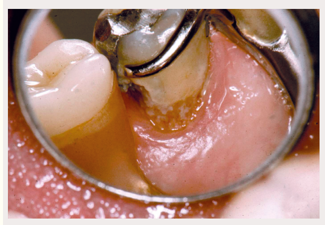
Fig. 1. The use of PRDPs is associated with increased plaque accumulation and caries risk as seen in this patient. Establishing and maintaining optimal oral hygiene through a systematic regimen of recalls and supportive therapy must be implemented.

Tradition, culture, mentors' opinions, education, legal aspects in claim investigations about what is «generally accepted treatment standards» etc. have influenced clinicians and care planners more than we care to admit.