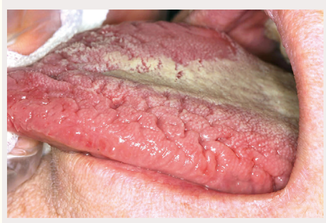
Fig. 1. Fissured tongue.