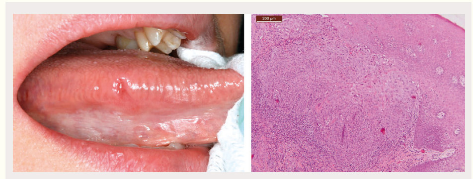
Fig. 3. Clinical picture of an oral mucosal lesion does not always tell the true nature of the lesion. A. A 49-year-old woman had persistent small ulcerative lesion on the border of the tongue. B. Histologically, the lesion turned out to be squamous cell carcinoma.

tion to infectious agents or are idiopathic (29). Infectious ulcers are single or multiple, and their clinical presentation is variable (see section «Specific microbes in disease-associated conditions»). Mucosal ulcers may also be involved in cyclic neutropenia, which is a rare blood dyscrasia manifesting as cyclic depletions of neutrophils from the blood and marrow.